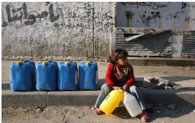
A child waiting to collect water in Rafah near the Gaza Strip's border with Egypt

The Gaza Strip is one of the most densely populated places on earth, with a total area of 365 km 2 and a population of over 1.4 million . Against the backdrop of occupation, the elections in 2006, the Hamas takeover of the Gaza Strip, and the resulting escalation in tensions, the situation for Palestinians in the Gaza Strip has worsened, with marked increases in unemployment, poverty and deaths. This situation has been compounded by the recent military incursion. Not only have people's livelihoods been severely affected, but entire families are rendered homeless. In addition, the crippling effects of the closures have been widely felt, with hundreds of thousands of jobs being lost, people prevented from reaching their places of work, children unable to attend their schools, fuel and import shortages kept at a bare minimum, and the majority of the population dependant on humanitarian assistance.