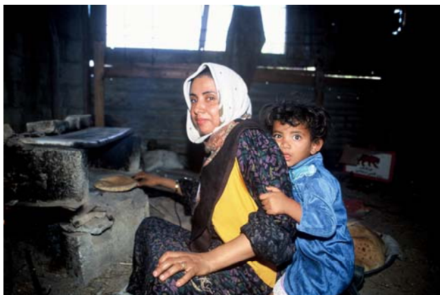
Empowerment of women in remote communities in Gaza through small grants programme

In December 1978, the UN General Assembly adopted resolution 33/147, which called on UNDP to provide assistance to the Palestinian people. By this date, the West Bank and the Gaza Strip had endured over 10 years of occupation, which had led to increased levels of poverty and unemployment. Hundreds of thousands were living in refugee camps in difficult conditions without the most basic amenities. Despite the steady population growth, infrastructure had been allowed to deteriorate, including schools, health facilities, housing, roads, and water and sanitation systems.